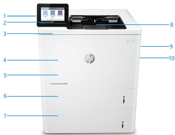
HP LaserJet Enterprise M609x