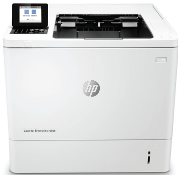
HP LaserJet Enterprise M609dn

This HP LaserJet Printer with JetIntelligence combines exceptional performance and energy efficiency with professional-quality documents right when you need them—all while protecting your network from attacks with the industry's deepest security. 1